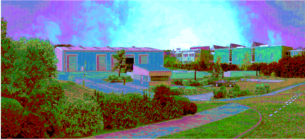
Clover Nook – Artists Impression