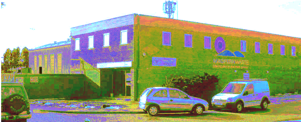
Magfern's Yard - The Site